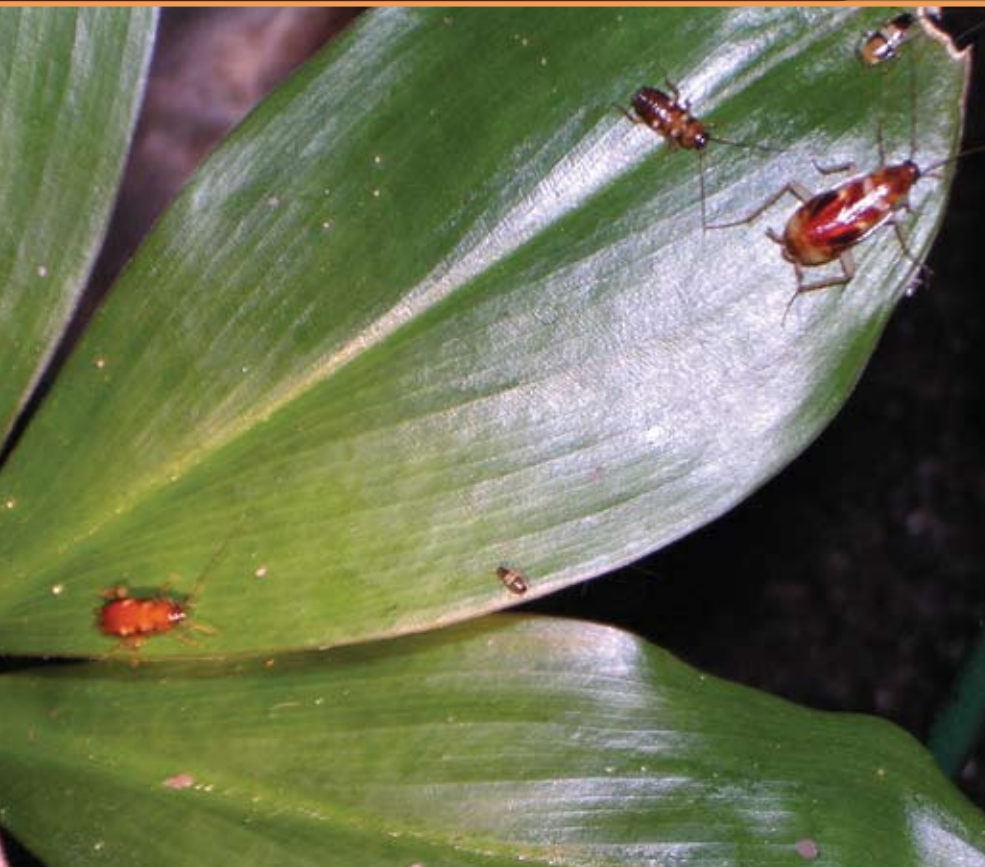
Brownbanded cockroaches perching on leaves in the conservatory at night.

In a particularly sensitive location, N.C. State researchers found a way to control cockroaches and prevent a public relations nightmare.