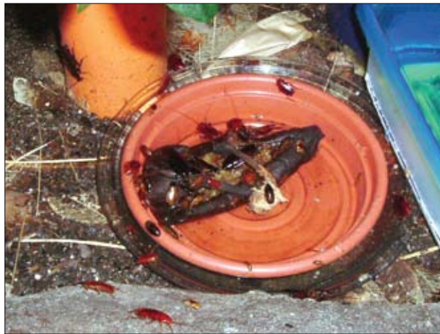
A feeding tray covered in cockroaches.

The results from this research project and demonstration highlight the need for unconventional approaches to pest control in environments that are extremely sensitive to the effects of traditional pest management. Furthermore, this provides pest management professionals with an alternative treatment approach should they find themselves with an account of similar sensitivity and under such public scrutiny. Long-term management of Supella may incorporate more elements, such as the parasitoid wasp Anastatus tenuipes , which nicely complements Comperia .